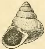
FIG. II.— Draparnaudia Walkeri , n.sp.

the present form belonged there; but since there exists in the British Museum a tablet of the form known under the name of singularis , bearing on the back, in Pfeiffer’s writing, the name and original locality, I have felt compelled to describe the species under consideration. It may be readily separated from D. singularis by its smaller size, and by its being only slightly, instead of strongly, keeled; while, as compared with the specimen of Gassies’ D. turgidula , from his collection, and now